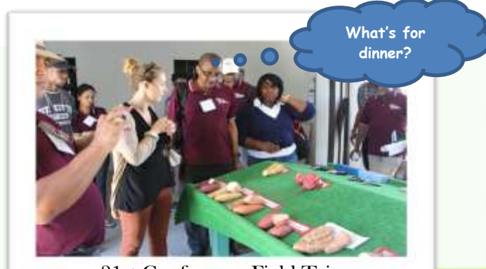
31st Conference Field Trip