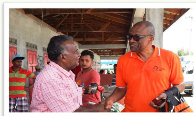
President of CAES (right) greeting the President of the Local Fisherman's Association (left)