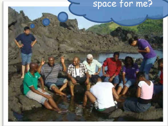
29 th West Indies Agricultural Economics Conference Field Trip